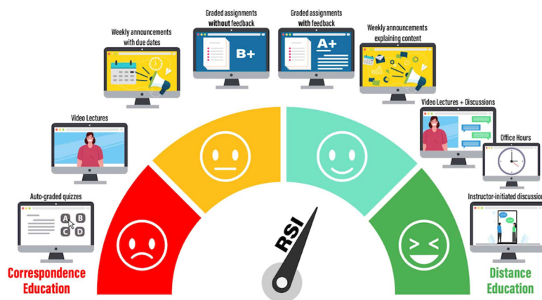
Regular and Substantive Interaction (RSI) Dashboard Illustration

As a VSU Online student, you must regularly participate in your online course by logging in, completing assignments, participating in discussion boards or other interactive activities, and staying in contact with your VSU online course instructor.