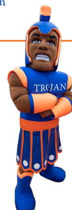
Mascot: Troy the Trojan