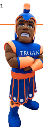
Mascot: Troy the Trojan