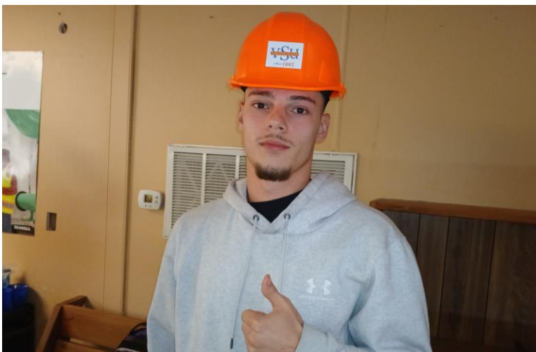
Real Estate Club students participated in a VIP tour of the new VSU academic building construction. (left)