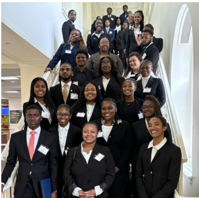
FBLA students in the moments before competing at UVA.