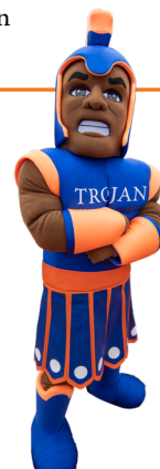
Mascot: Troy the Trojan