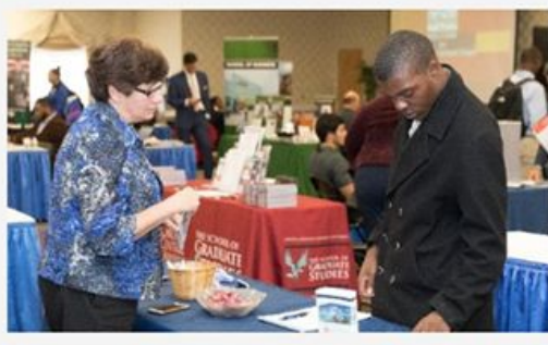
Priority 2: Academic Excellence