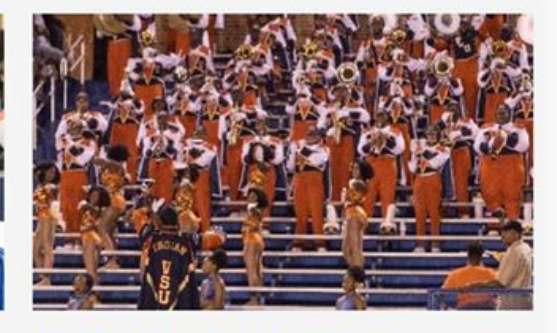
Priority 3: Student Experience